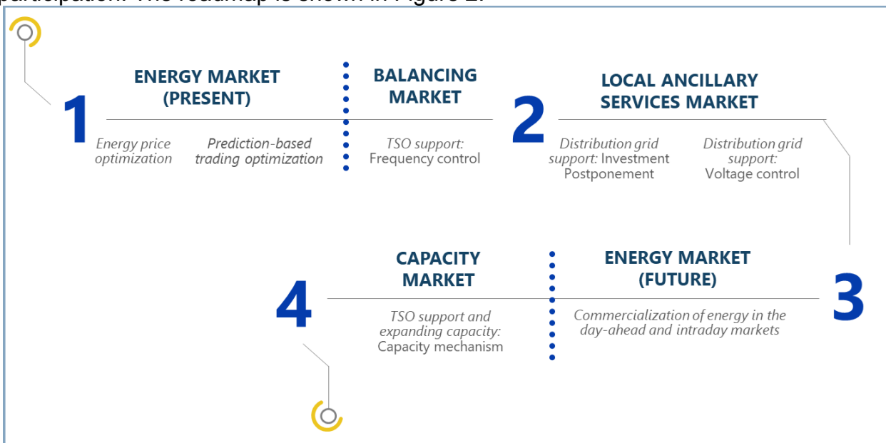
Figure 2 – Markets Roadmap

Considering current Brazilian regulatory context and future trends, a roadmap of expected market implementation was developed, in order to estimate future markets for VPP participation. The roadmap is shown in Figure 2.